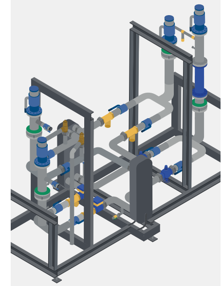
Inside bigger buildings, we will replace your existing boiler with a big heat exchange system.